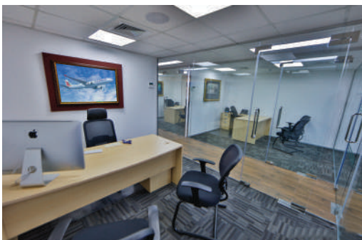
New Zealand Office