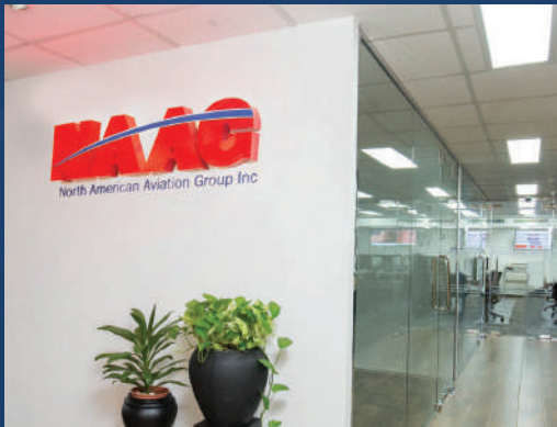
Sri Lanka Office